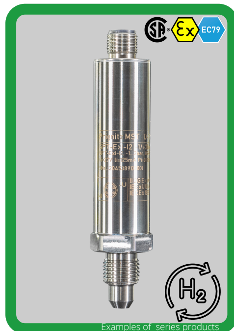
Examples of series products

Class 2258 84 PROCESS CONTROL EQUIPMENT (for hazardous locations- certified to US standards)